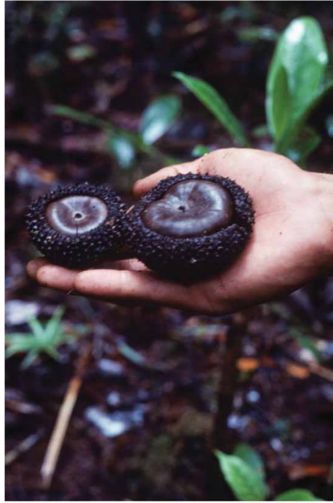
FIGURE 4 Acorns eaten by wild pigs in the forests of the Kelabit Highlands. Photo: Kaz Janowski, 1987.

still densely forested and thinly populated, and while I lived in the community young men in particular spent a good deal of their time hunting (Janowski in press b ) (see Figure 5 ). Chickens are slaughtered only if guests arrive from outside the longhouse. Buffaloes and domestic pigs are slaughtered only for naming feasts, irau pekaa ngadan .