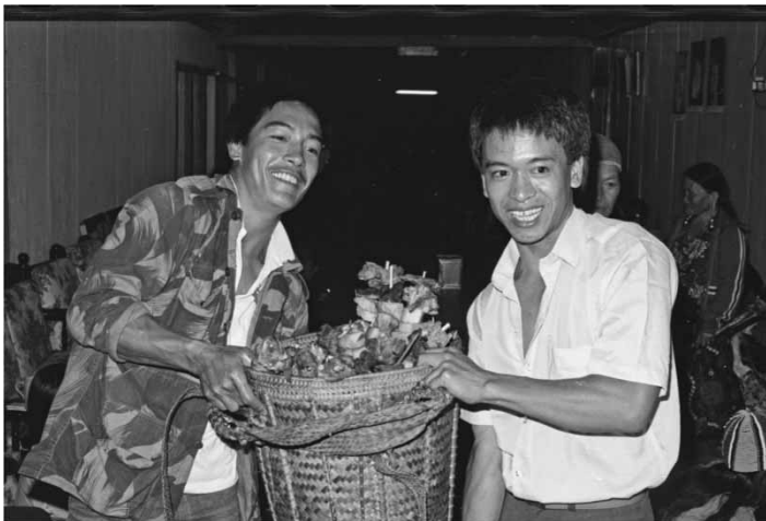
FIGURE 13 Young men distributing meat at an irau in Bario. Photo: Kaz Janowski, 1988.

At irau I have attended in the Kelabit Highlands food is prepared and distributed just as described in the tale of Balang Lipang above: pork and buffalo meat is cooked, skewered and distributed by men (see Figure 13), with the older men distributing the pig fat, while rice is prepared and distributed by women. This generates an association between