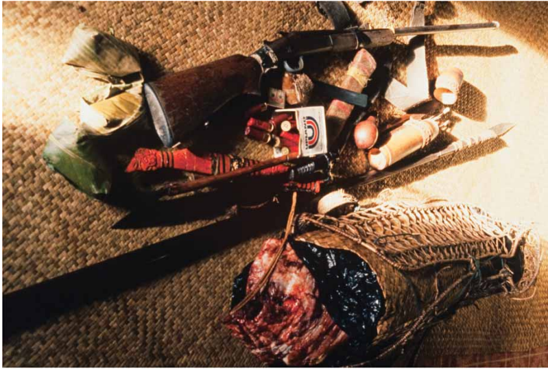
FIGURE 8 Hunted wild pig meat in a bekang basket with assorted hunting equipment including shotgun, cartridges, quiver filled with blowpipe darts, gourd to hold blowpipe flights, damar resin for lighting fires; and a pig spear. Bundles of rice wrapped in leaves are also shown, to be eaten in the forest.

Pigs were in the 1980s (and still are) butchered in the forest and brought back in large pieces in men's bekang baskets (see Figure 8). Once back in the longhouse, the hunters cut up the pieces and sent portions of meat to neighbours, kin and friends through children. Some meat was often smoked to preserve it for a few days but most was consumed very quickly, since there was no refrigeration. In a community like Pa' Dalih the whole longhouse benefitted from hunting, not just the hearth-groups to which hunters belong. There was no sense of charity nor was any debt created by the distribution of meat. This also applied to the gathering of wild vegetables as well as cultivated vegetables and root crops which were freely shared with others in the longhouse without any implications of debt except in the sense that it was polite to reciprocate in kind in due course. This contrasted with the attitude to sharing rice, whether cooked or uncooked; if a hearth-group ran short of rice and had to borrow it from neighbours this created either a debt which needed to be repaid or a sense of inferiority and shame on the part of the recipient. In addition, it was not seen as appropriate to eat rice produced by another hearth-group, so borrowing rice was avoided as far as possible.