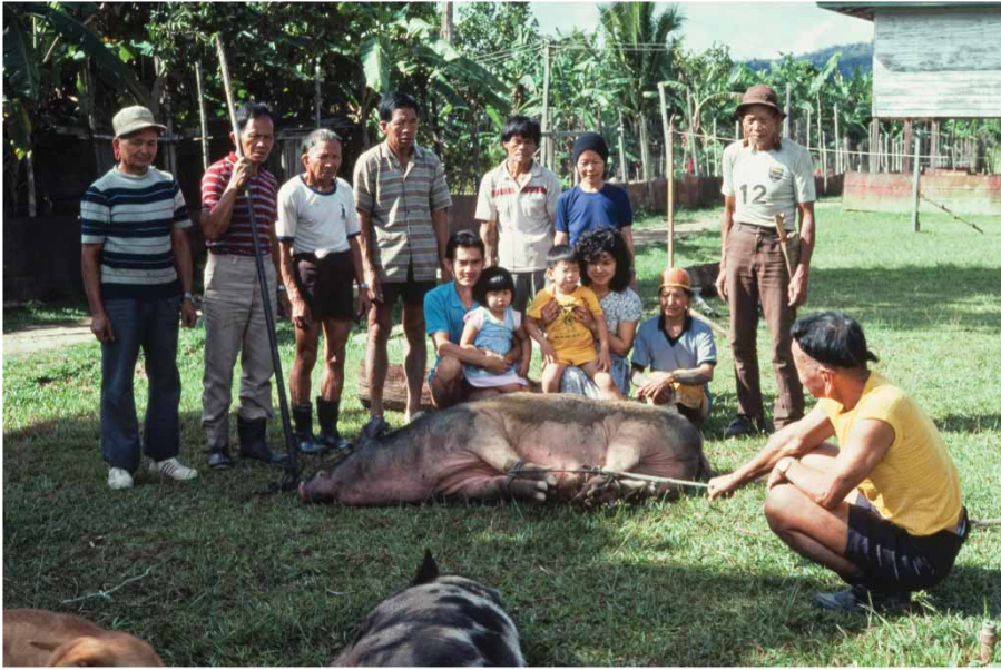
FIGURE 12 The hosts of an irau in Bario in 1988 posing for a photograph with the water buffalo ( kerubau ) which is to be slaughtered for the feast.