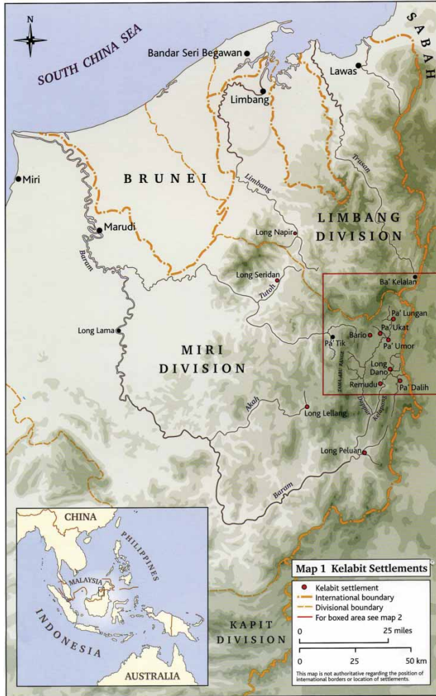
FIGURE 2 Map of part of Central North Borneo, showing the Kelabit Highlands.

Kelabit community is a perennial balancing act between the longhouse and its surrounding fields on the one hand and the forest just beyond on the other. The people of the Highlands see both as important and necessary to human life (see Janowski 2003a). For them, rice is basic to their way of life and to ulun . But humans must also have access to the force which the Kelabit call lalud , which can be glossed as wild life-force (Janowski 2007). Lalud comes ultimately from the Creator Deity. It can, the Kelabit now believe, be most easily accessed through Jesus Christ; but it is considered to be present in all living things (see Janowski 2012). It is, I have argued (Janowski 2007) brought into the settlement in wild plants and the meat of hunted animals – especially pigs, the main and preferred game animal. 3