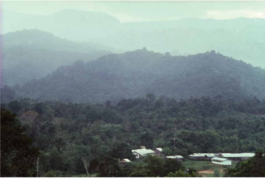
FIGURE 1 The longhouse community of Pa' Dalih in the southern part of the Kelabit Highlands in 1987. In the distance can be seen part of the Apad Uat ('Root Mountain Range'), which divides Sarawak from Kalimantan. Photo: Kaz Janowski, 1987.