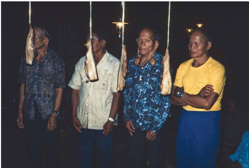
FIGURE 10 A fat-eating competition about to begin at an irau in Pa' Dalih in 1987. Only men over about the age of 40 are participating. Photo: Kaz Janowski, 1987.

them fat (see Figure 11 ), underlining the association between the sexual relationship and the transmission of lalud on the part of men. Although fat is distributed to everyone at irau , women do not eat it on the spot as men often do, but take it home afterwards and