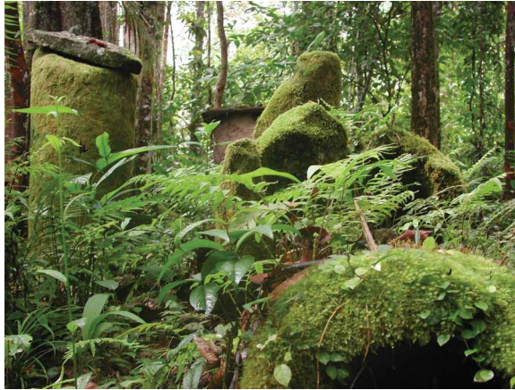
FIGURE 4 The megalithic cemetery, menatoh , at Long Diit near Pa' Dalih, where the dead of the settlements in the area were placed until the 1950s when the Kelabit became Christian. Photo by Monica Janowski, 2005.

as tanem , deriving from the word for 'to bury'. Most Kelabit say that the dead do not remain in the tanem but go to heaven, although some people thought that some dead, who had not behaved well in life, might perhaps remain in the tanem .