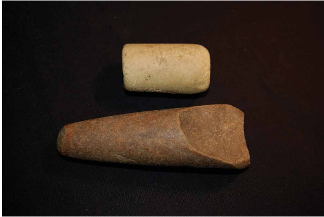
FIGURE 2 Two 'thunderstones' ( batu pera'it ), found by inhabitants of Pa' Dalih at abandoned settlements nearby, and bought from them in 1987 by Monica Janowski on behalf of the British Museum. They had almost certainly been stored in rice barns at the settlements in the belief that they would increase the amount of rice in the barn through their power ( lalud ).

attract pera'it , and until recently the use of these in house-building was avoided. Such stones are said to be batu pera'it ('thunderstones'), because they derive from thunder. Many informants also said that they are 'teeth of thunder' ( lipen pera'it ), echoing the views of other peoples in Sarawak, Sabah, Peninsular Malaysia and in the Naga Hills in Burma (e.g. Evans 1913; Hose and McDougall 1966: 11; Hutton 1926).