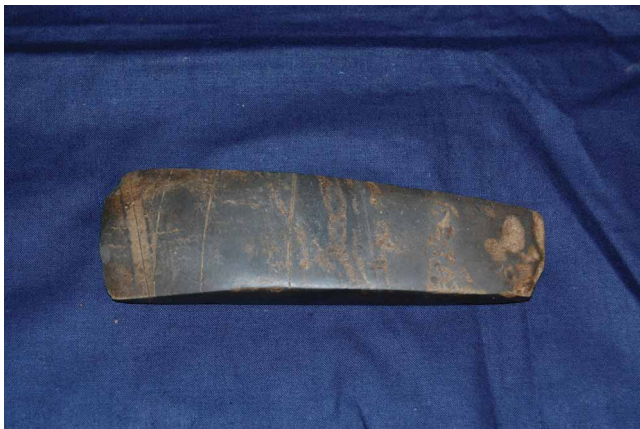
FIGURE 3 A stone axe, described as a 'thunderstone', kara ngkuk , kept by the Semang of the upper Siang River. Donated to the British Museum by B. Cerruti in 1906.

Thunder is believed to have great power (Kelabit: lalud ; Penan: penyukat ), and thunderstones are believed to be a concentrated or petrified form of that power. Kelabit and Penan see the cosmos as suffused with power. Lalud/penyukat is seen as being essentially the same as life; if something has power, it is alive. Not only plants and animals, but also stones, earth and water are seen to be, in some sense, 'alive' (Penan 'to have life [ urip ]');